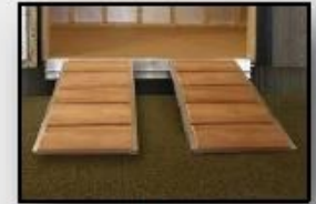
Innovative Ramp System