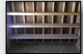
3 Tier Shelves (16" Deep)