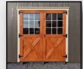
Craftsman Series Door w/ Glass

*** ALL STANDARD OPTIONS REMOVED WILL RECEIVE 50% OFF LISTED PRICE ***