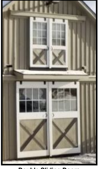
Double Sliding Doors Above Center Aisle