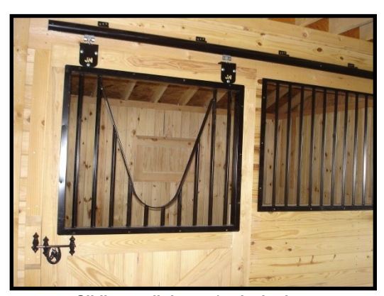
Sliding stall door w/ yoke in door