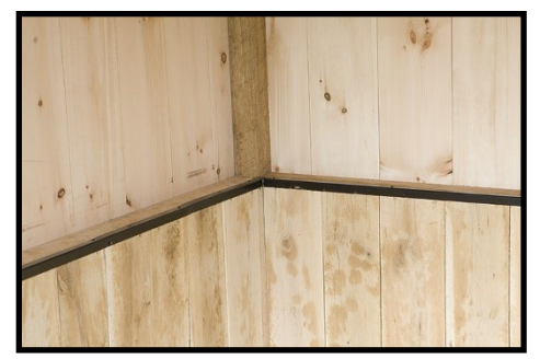
Chew guard in stall