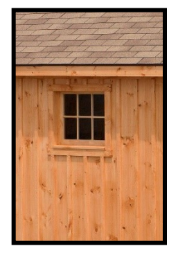
28"x24" Standard Window Slides horizontally