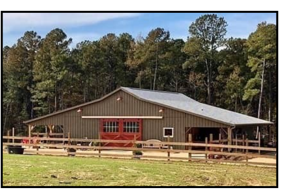
CUSTOMIZE YOUR BARN - shown with two lean to's