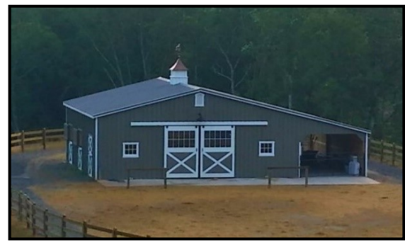
CUSTOMIZE YOUR BARN - shown with one lean to