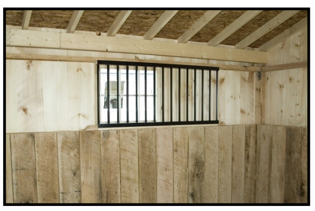
Interior view of 28"x24" standard window w/ metal grill