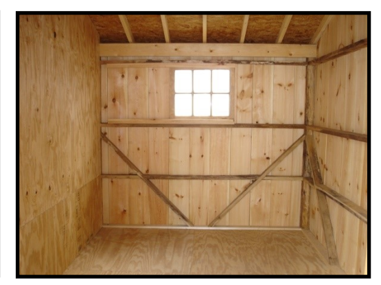
Interior view of tack room