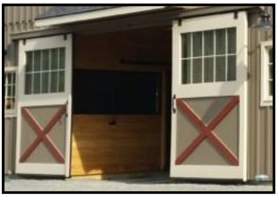
Tempered Glass In Aisle Doors