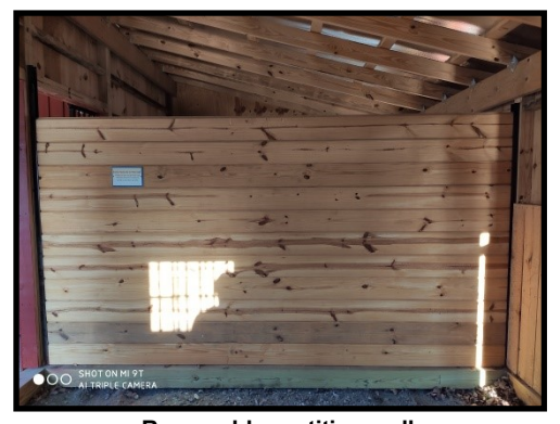
Removable partition wall