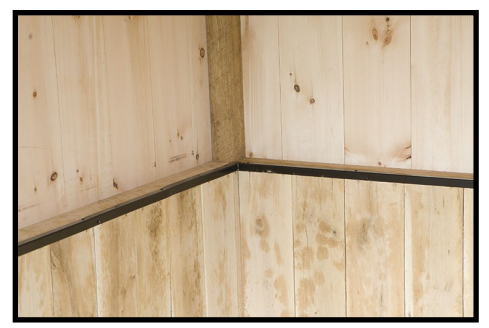
Chew guard in stall