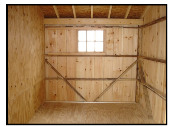
Interior view of tack room