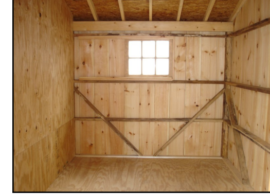
Inside of tack room - One window, full floor, and solid divider wall