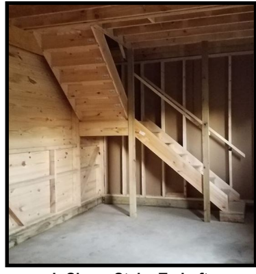
L-Shape Stairs To Loft