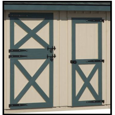
4'x7' Dutch Door