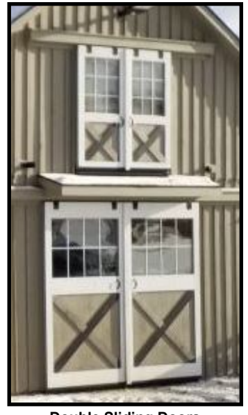
Double Sliding Doors Above Center Aisle