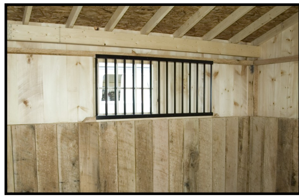
Interior view of 28"x24" standard window w/ metal grill