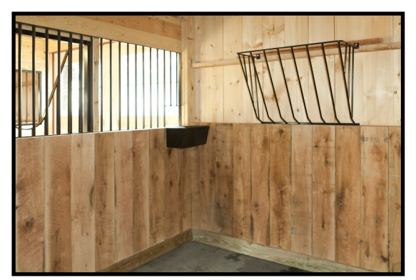
3' Wall mounted hayrack w/ feed hole in grill