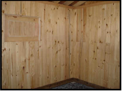
SYP Kickboard - Floor to ceiling