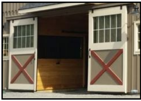
Tempered Glass In Aisle Doors