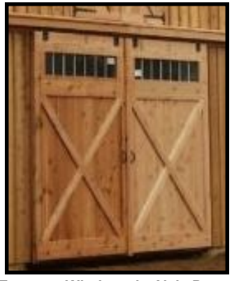
Transom Windows in Aisle Doors