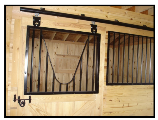
Sliding stall door w/ yoke in door