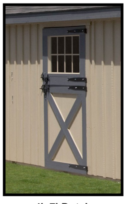
4'x7' Dutch Door w/ Window