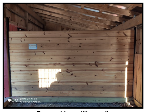
Removable partition wall